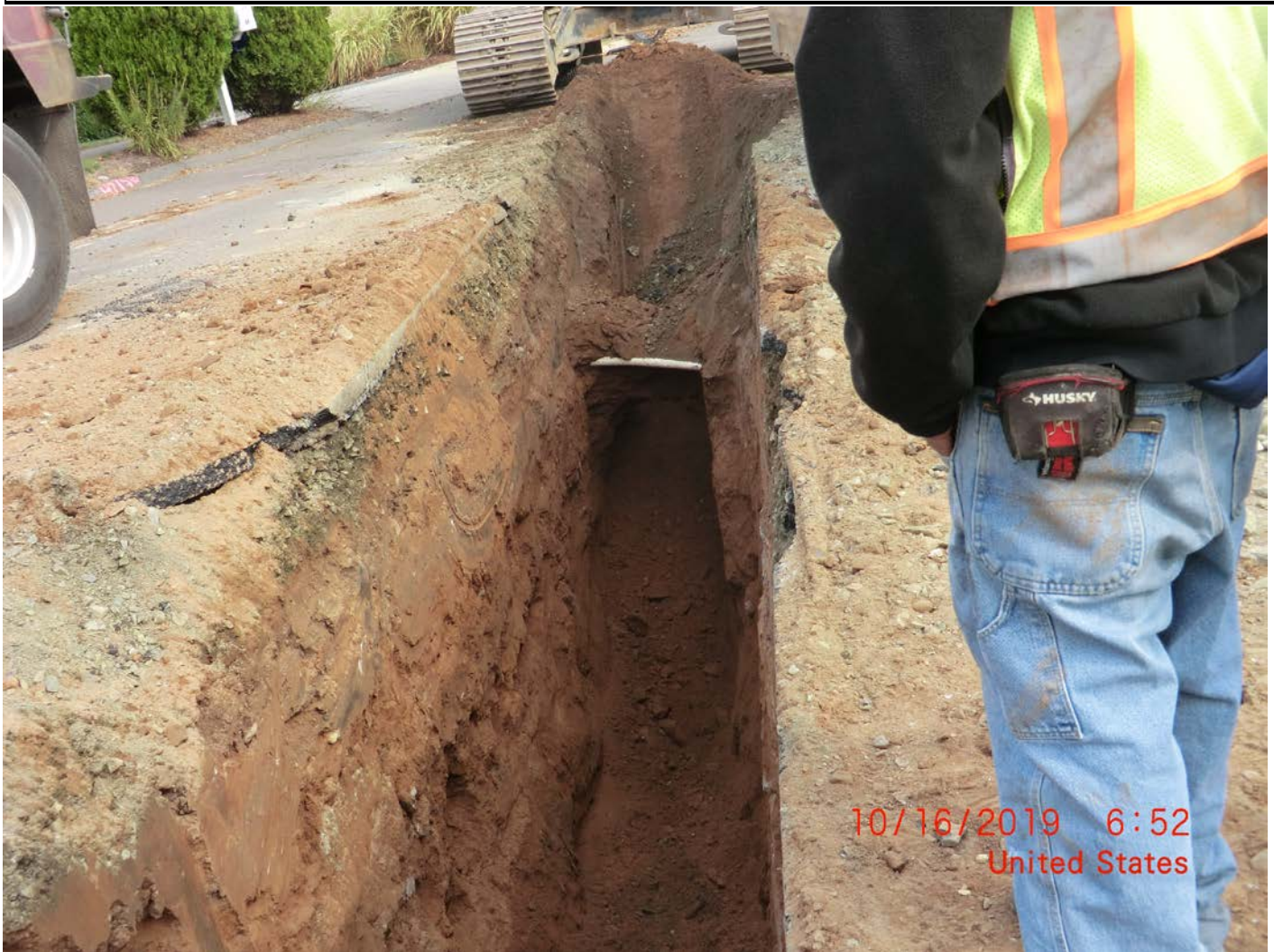
Figure 5 – Facing east into trench. Excavating around electrical/tv conduits. Disregard time stamp.

Date: October 16, 2019 Day of Week: Wednesday Report No: 14 Page: 7 of 11