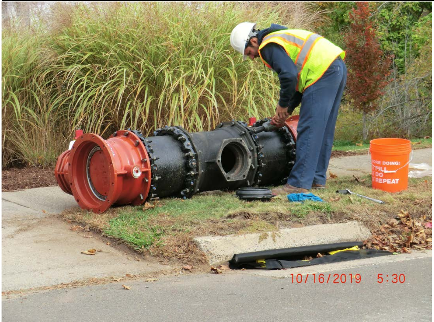
Figure 4 – Disassembling 3-valve T-section. Note the 11-o'clock position on the 8-inch flange (center of shot). There is no bolt hole in the flange. New retainers used in the reconstruction. Disregard time stamp.

Date: October 16, 2019 Day of Week: Wednesday Report No: 14 Page: 6 of 11