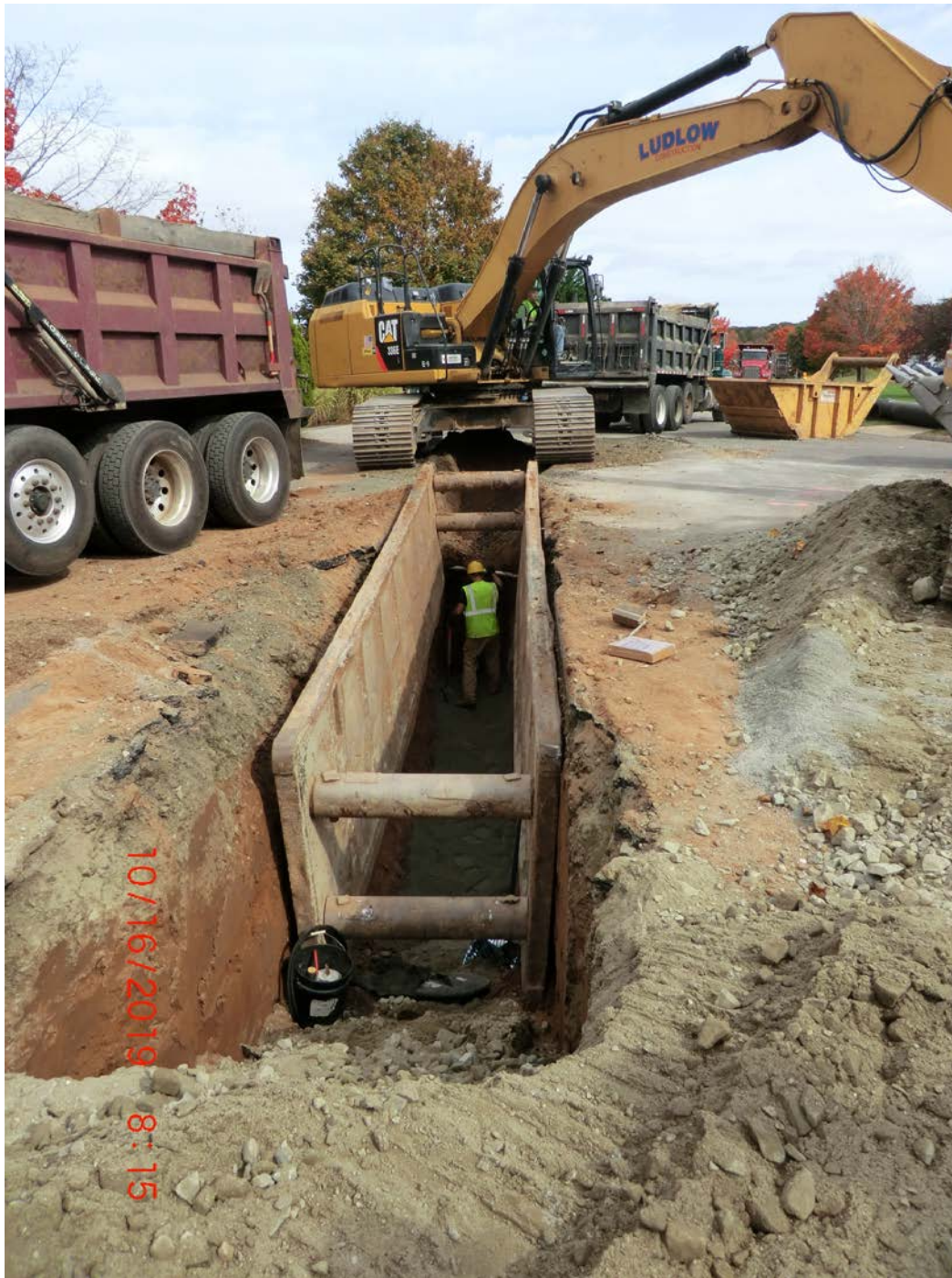
Figure 6 – Facing east, only full 20-foot run of 16” DI installed today. Trench box is 24 feet. Disregard time stamp.