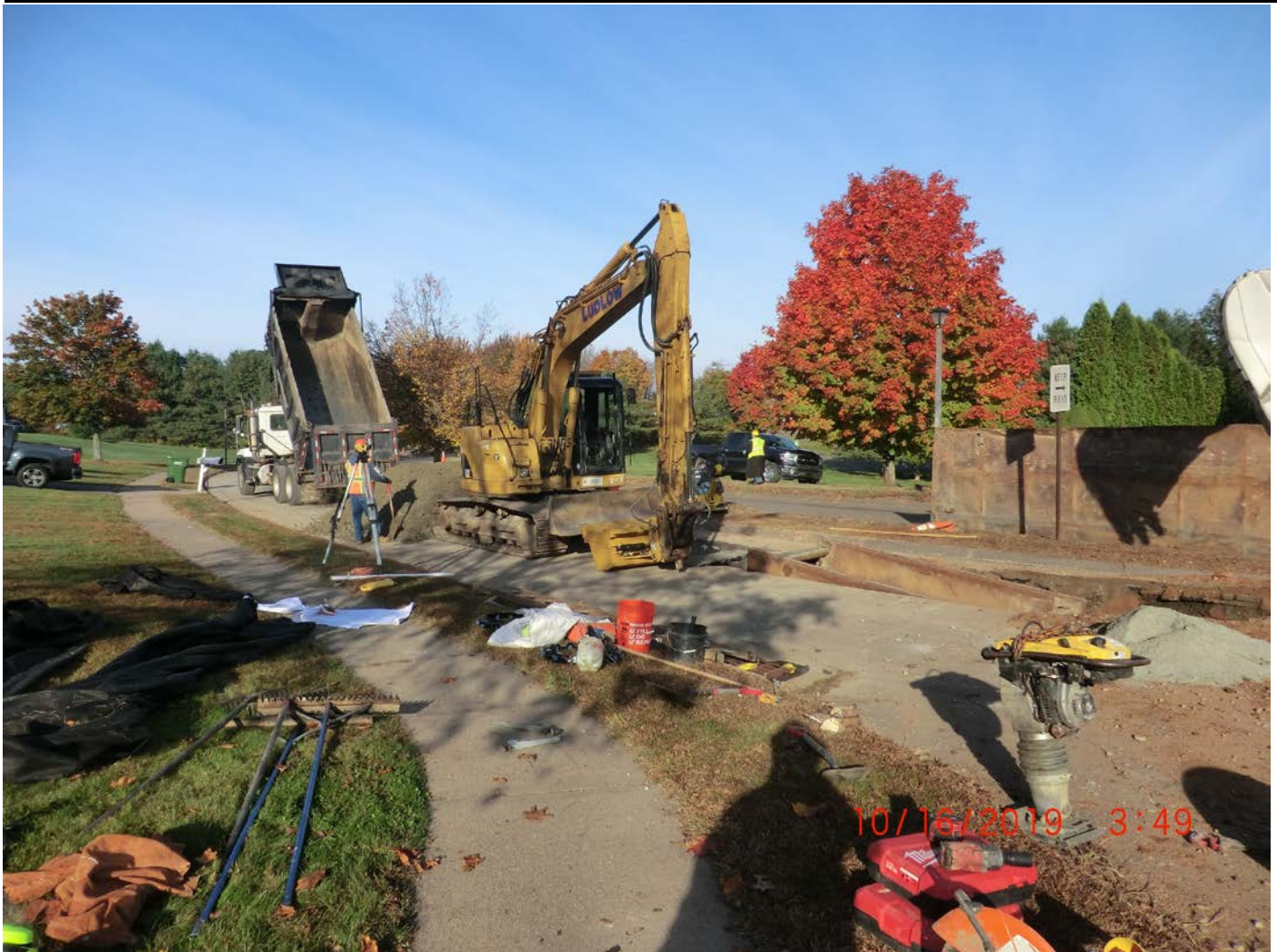
Figure 3 – Picture taken facing west from corner of Watch Hill and Talcott Ridge Drives. Overview of start of day. Disregard time stamp.

Date: October 16, 2019 Day of Week: Wednesday Report No: 14 Page: 5 of 11