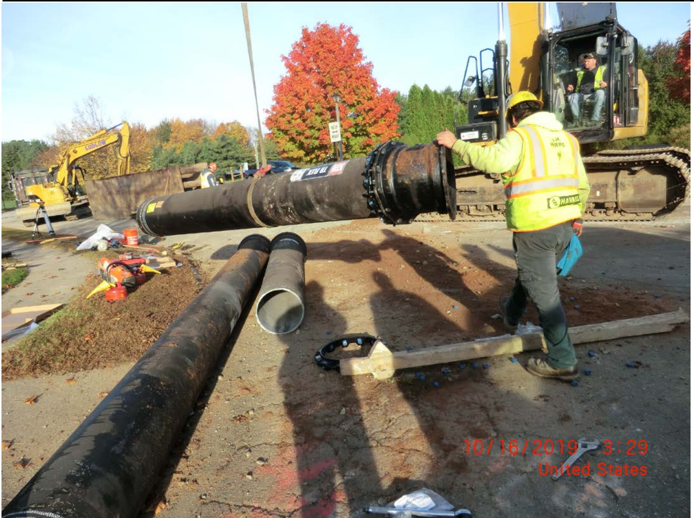
Figure 2 – Facing NW, Picture of 22.5° bend installation. First section of the day. Disregard time stamp.