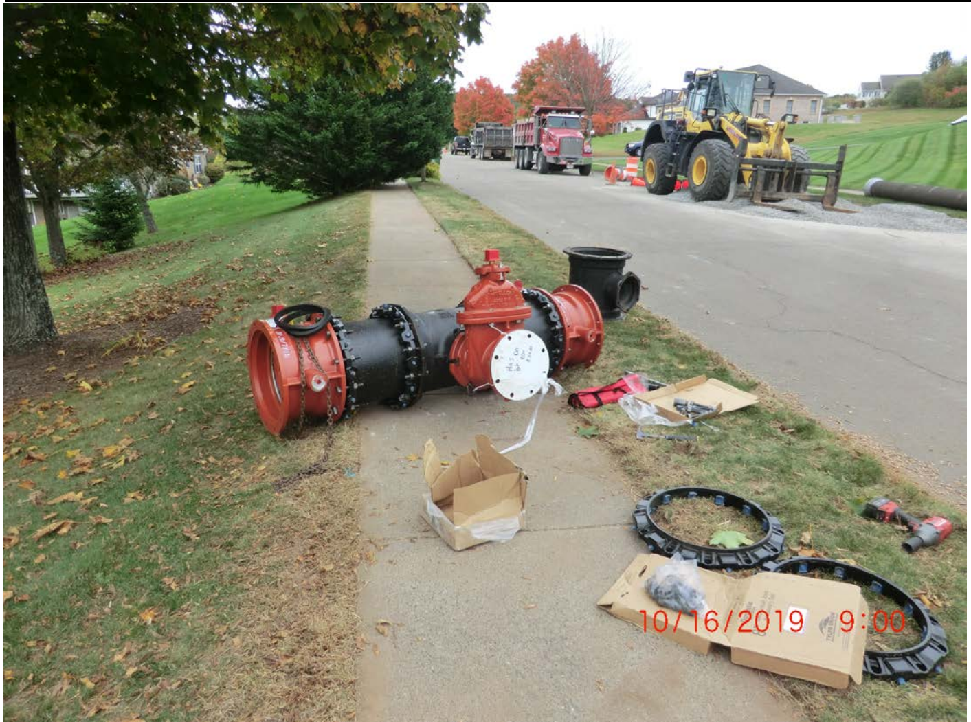
Figure 8 – View of reconstructed assembly shown in Figure 4. This is the Watch Hill Drive 8” Tee-section (to be installed tomorrow on 10/17/19). The left and right are 16” butterfly valves and the center valve is an 8” gate valve. Disregard time stamp.