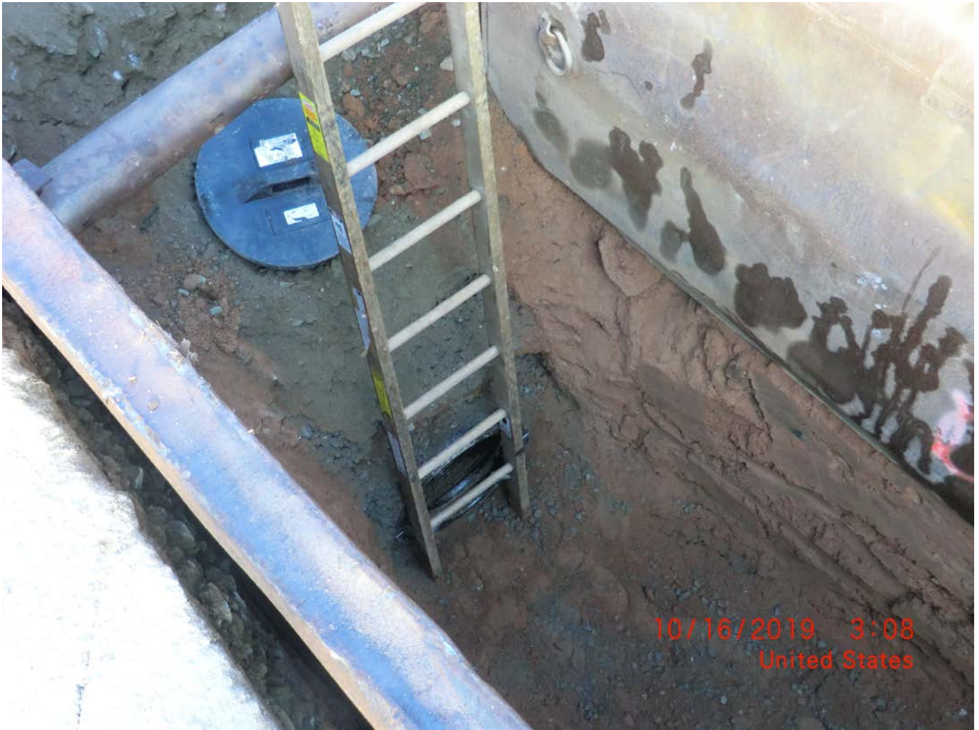
Figure 1 – Station 47+75. Starting point. Disregard time stamp.