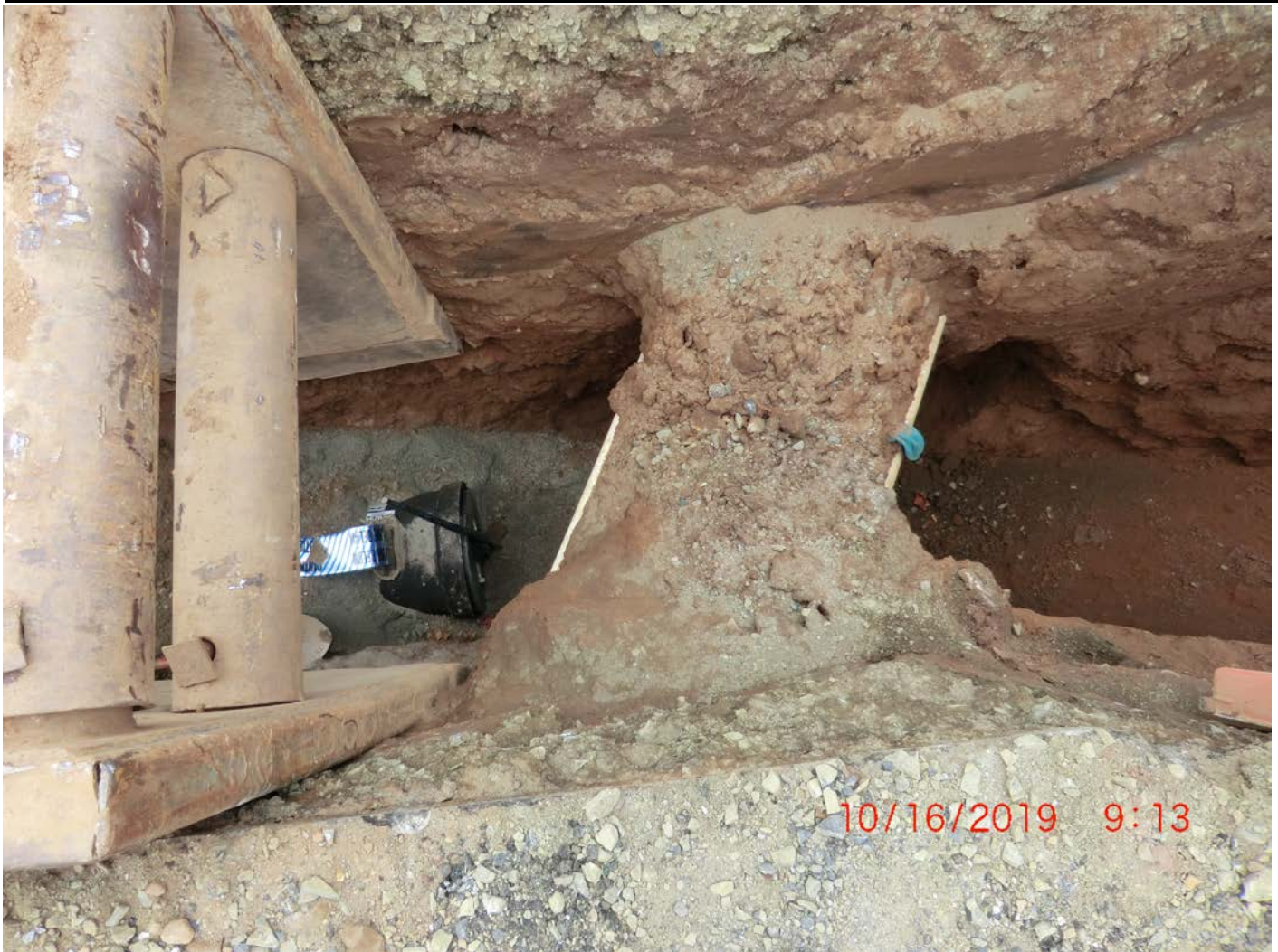
Figure 7 – End of 20-foot section of pipe, approximately 2 feet short of the conduit. Disregard time stamp.